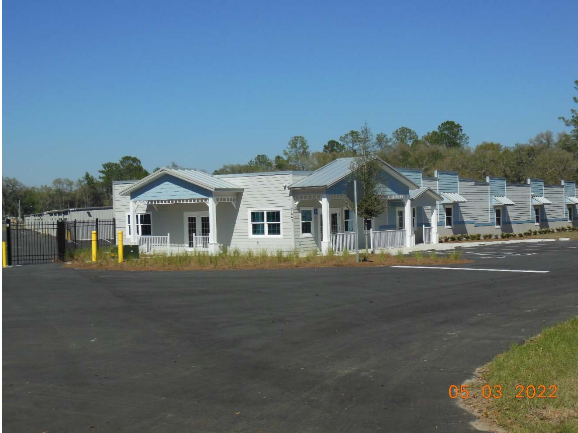
View from site's entrance at NE 49 th Terrace